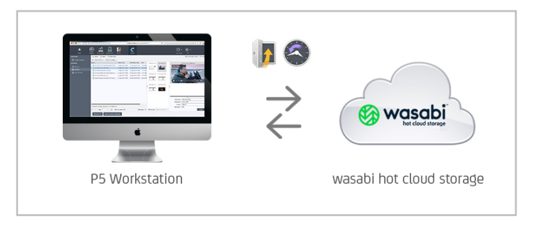
P5 Archive and P5 Backup to Wasabi hot cloud storage

The P5 Archive metadata and preview catalogue allows users to easily find and retrieve media files, such as images and videos